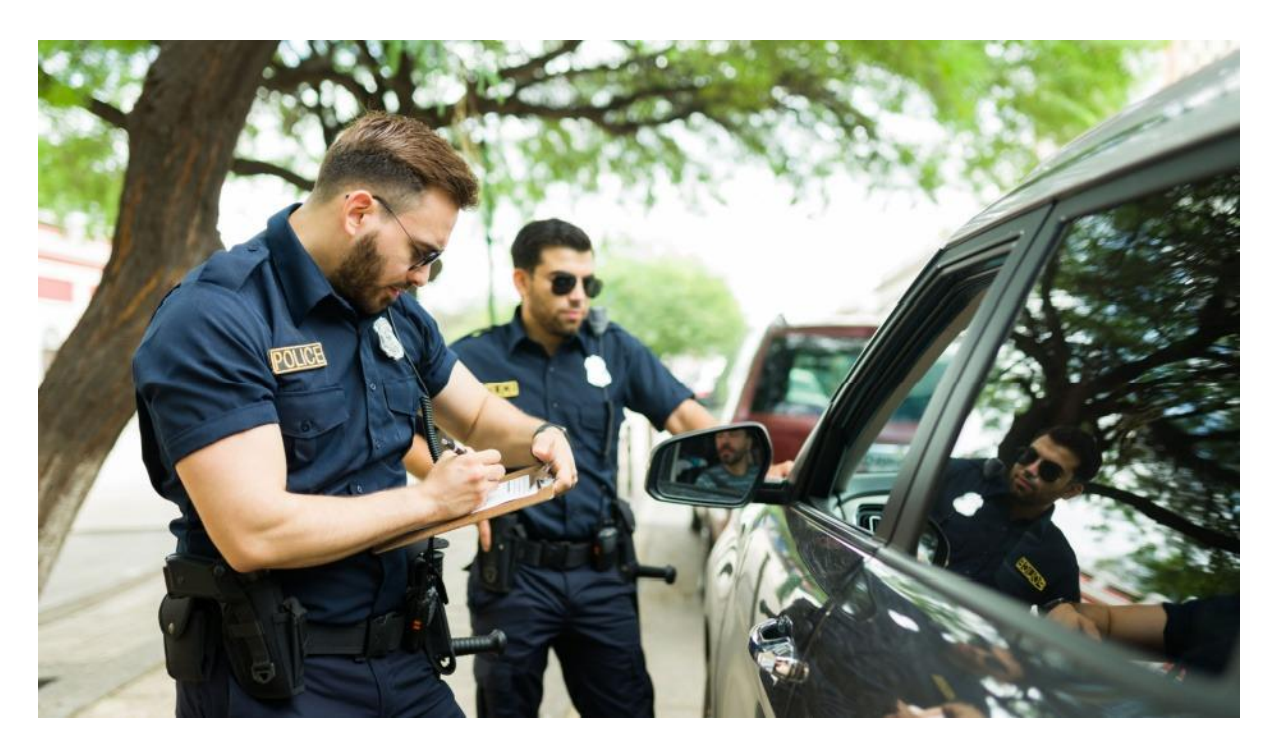
and will defend your rights vigorously, aiming to minimize penalties or secure case dismissals when possible.

When you seek legal help in Lüneburg, relying on experts who understand the local legal landscape and specialize in these critical areas can make all the difference. Whether you need a Traffic Law Attorney Lüneburg, an Employment Law Attorney Lüneburg, a Tenancy Law Attorney Lüneburg, a Construction Law Attorney Lüneburg, or a Traffic Criminal Law Attorney Lüneburg, the right legal team is ready to stand with you. Their commitment to clear communication, personalized strategies, and effective advocacy ensures you get the support you deserve in any legal matter. Don't hesitate to consult trusted attorneys in Lüneburg to protect your rights and achieve the best possible results.